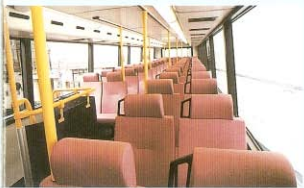
上層車廂廣闊寬敞而舒適，設有57個座位 There are 57 seats on the spacious and comfortable upper deck

KMB is proud to present our superbly designed "BUSES of the NEXT GENERATION". Being the first double deck easy access buses in the world, their inclusion into our bus fleet marks the beginning of a new era of bus service.