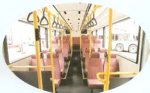
下層共有33個座位加一個輪椅位置（或35個座位）及36個企位 33 seated passengers plus 1 wheelchair (or 35 seated passengers) and 36 standing passengers can be carried in the lower deck

本車款具有現代化、美觀的外型，而車廂則親切、舒適和容易上落，它的下層共有33個座位加一個輪椅位置（或35個座位）及36個企位，上層則設有57個座位。